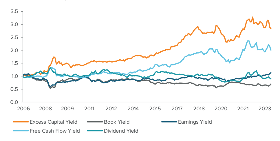
As of 12/31/23. Past performance is no guarantee of future results.

Cumulative, cap-weighted quintile spread returns, R1000V ex-financials, REITs and utilities